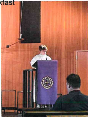
Reading scripture lesson