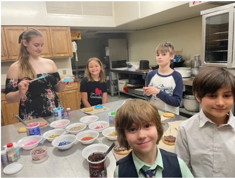
Frosting cookies for Mom (and one for themselves) on Mother's Day