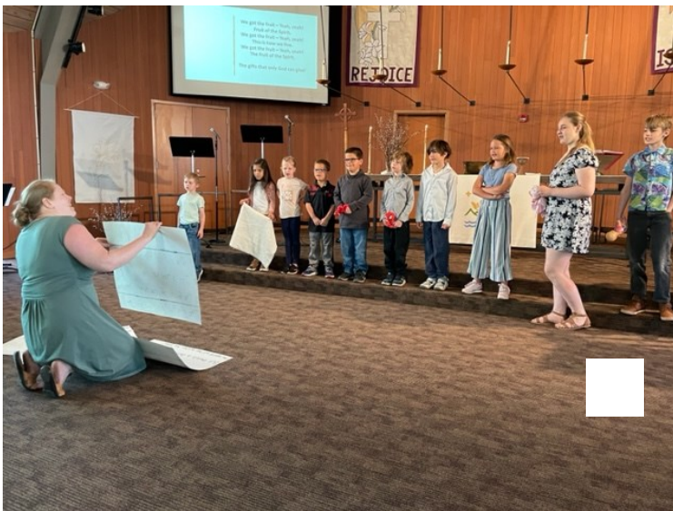
Singing on the last day of Sunday School for this year, May 21st